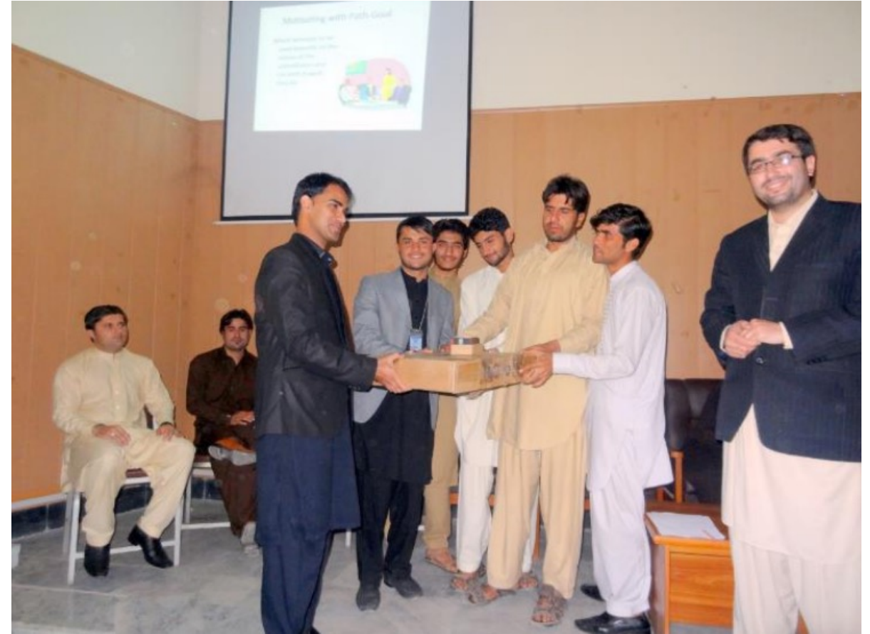
Members of the boys team with their computer presented by [REDACTED] (right)