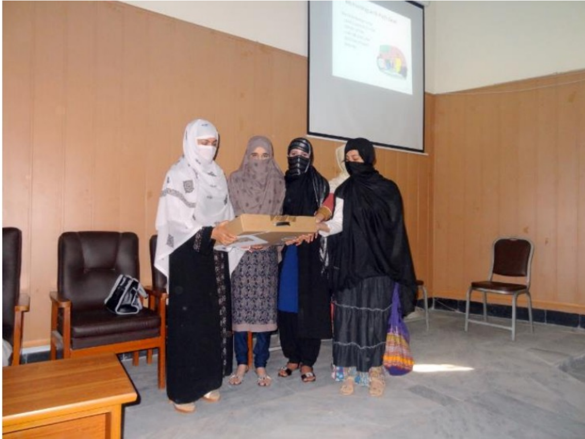
Members of the girls team with their computer