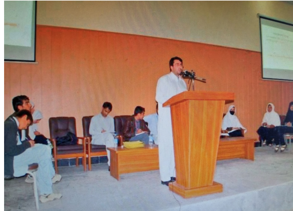
ADDRESSING YOUNG PEOPLE IN JALALABAD BEFORE LEADING A DEBATE BETWEEN GIRLS AND BOYS ABOUT DEMOCRATIC ELECTIONS